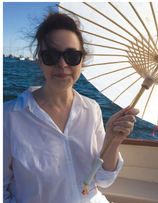
Moore takes a break from writing

INVITED MERRILL FELLOW Lorrie Moore read at La Grua Center on July 24. Introducing the acclaimed author to a packed house, poet and literary critic J.D. McClatchy cited her “Shakespearean” knack for mixing comedy and pathos to expose the most deluded emotions and calamitous aspects of human nature. This was demonstrated wonderfully in Moore’s reading of “The Juniper Tree,” a mordant tale about a professor visited by the ghost of her recently deceased friend from her recent collection Bark , published by Alfred A. Knopf. Currently the Gertrude Conaway Vanderbilt Professor of English at Vanderbilt University in Nashville, Tennessee, Moore described her first extended visit to the Borough as a “magical two weeks in a magical place.” She added, “Not only does one feel the brilliant and blithe spirits in the house, the printer works.”